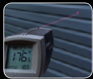
Heat gun pointed at Kaycan vinyl siding at a temperature of 176.5°F. No distortion from the intense heat.