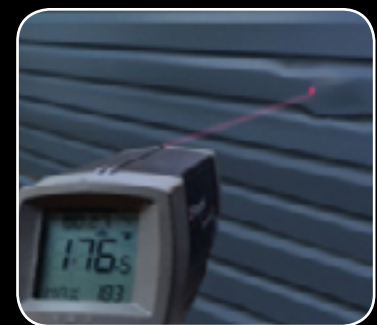
Heat gun pointed at competitor's siding at a temperature of 176.5°F. Siding tends to deform in the heat.